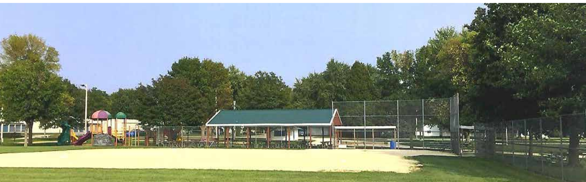
A view of the Ball Park showing one of the ball fields and the shelter and playground equipment.